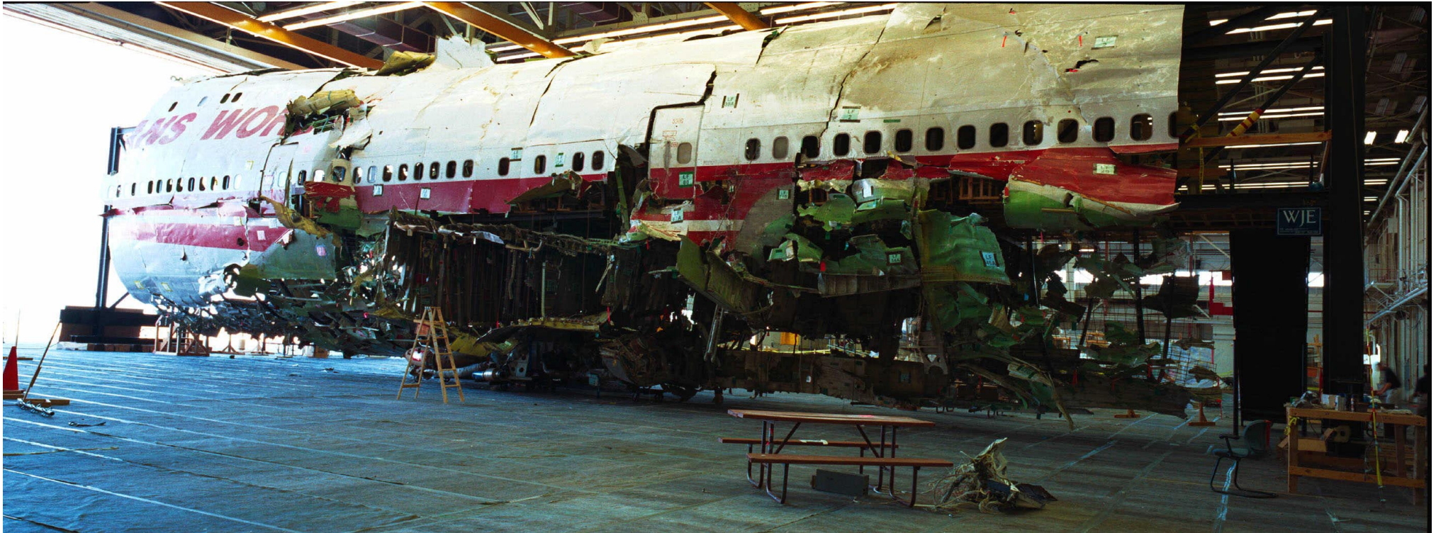
Photo 1. TWA800 fuselage reconstruction