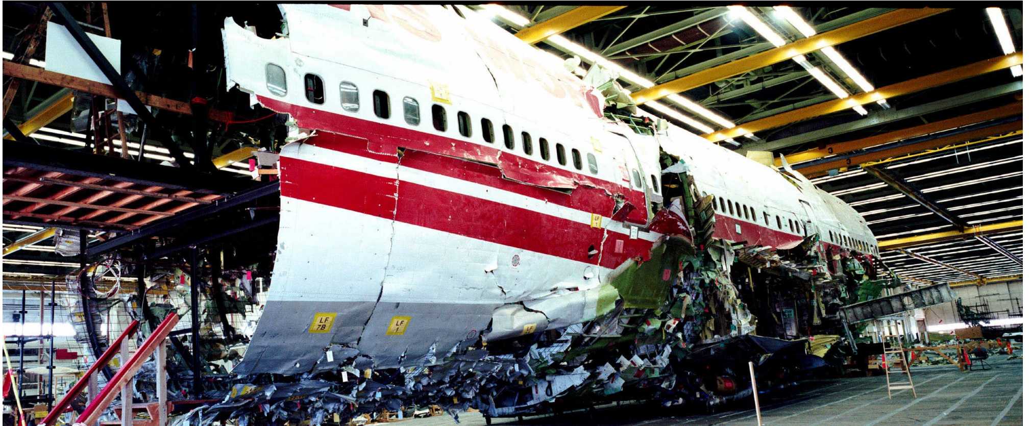
Photo 2. TWA800 fuselage reconstruction